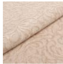
Afrodite 56 Natural 1000456