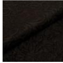
Afrodite 4 Black 1000404