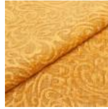
Afrodite 5 Gold 1000405