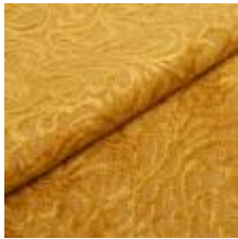
Afrodite 23 Olive 1000423