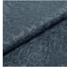
Afrodite 12 Denim 1000412