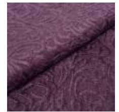
Afrodite 71 Violet 1000471