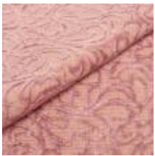
Afrodite 81 Pastell pink 1000481