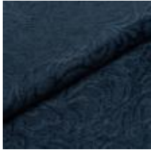
Afrodite 2 Midnight 1000402