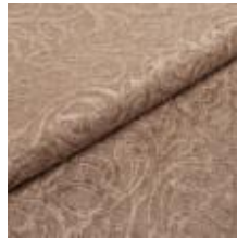
Afrodite 26 Beige 1000426