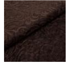
Afrodite 6 Mokka 1000406