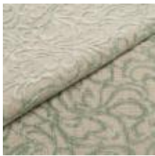
Afrodite 83 Pastell green 1000483