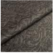
Afrodite 7 Graphite 1000407