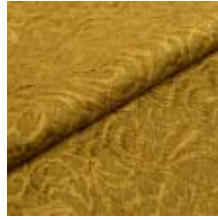
Afrodite 3 Forest 1000403