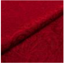
Afrodite 1 Wine 1000401