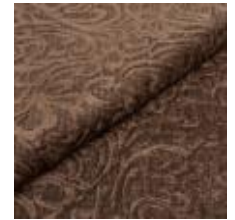
Afrodite 36 Light brown 1000436