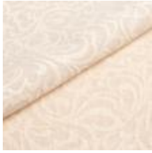
Afrodite 10 Off white 1000410