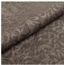
Afrodite 47 Fog 1000447