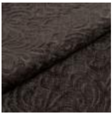
Afrodite 37 Antracit 1000437