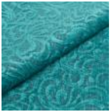
Afrodite 22 Turquoise 1000422