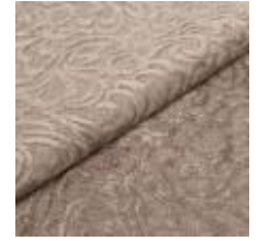
Afrodite 17 Concrete 1000417